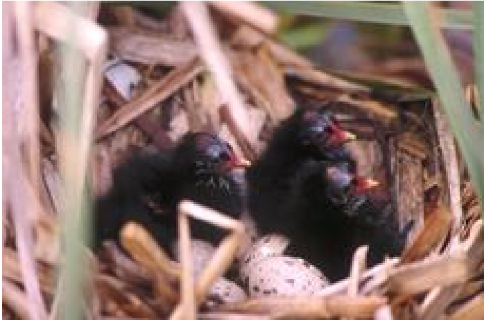
Newly Hatched Chicks

The eggs are about 43 mm by 31 mm. They are green with redish brown or grey markings Both parents incubate the eggs and when they hatch they are looked after for a couple of days in the nest before swimming with the parents.