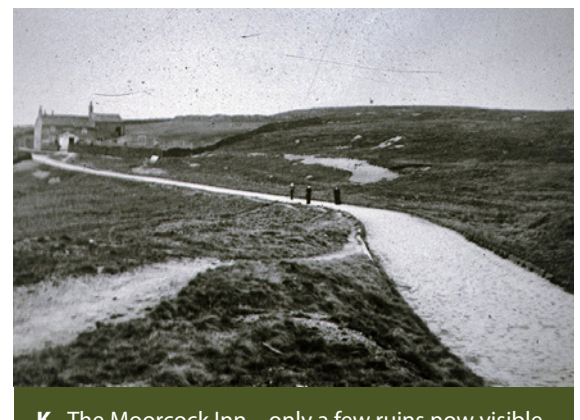
K - The Moorcock Inn – only a few ruins now visible